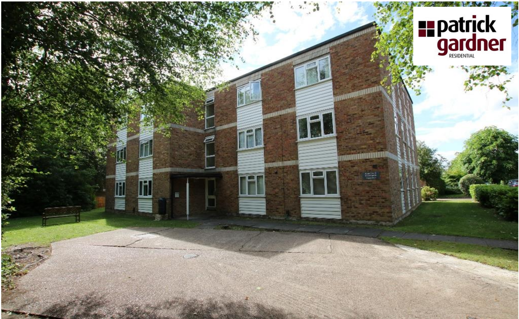
Courtlands , 7 Epsom Road, Leatherhead, Surrey KT22 8SS